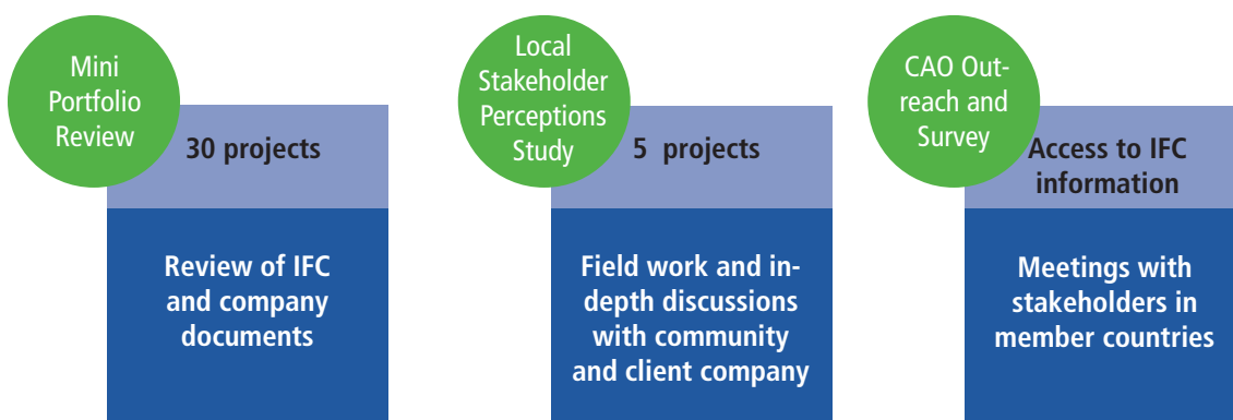
Figure A: Core Activities of CAO's Review

CAO found that while the Performance Standards have encouraged consultation with host communities across a